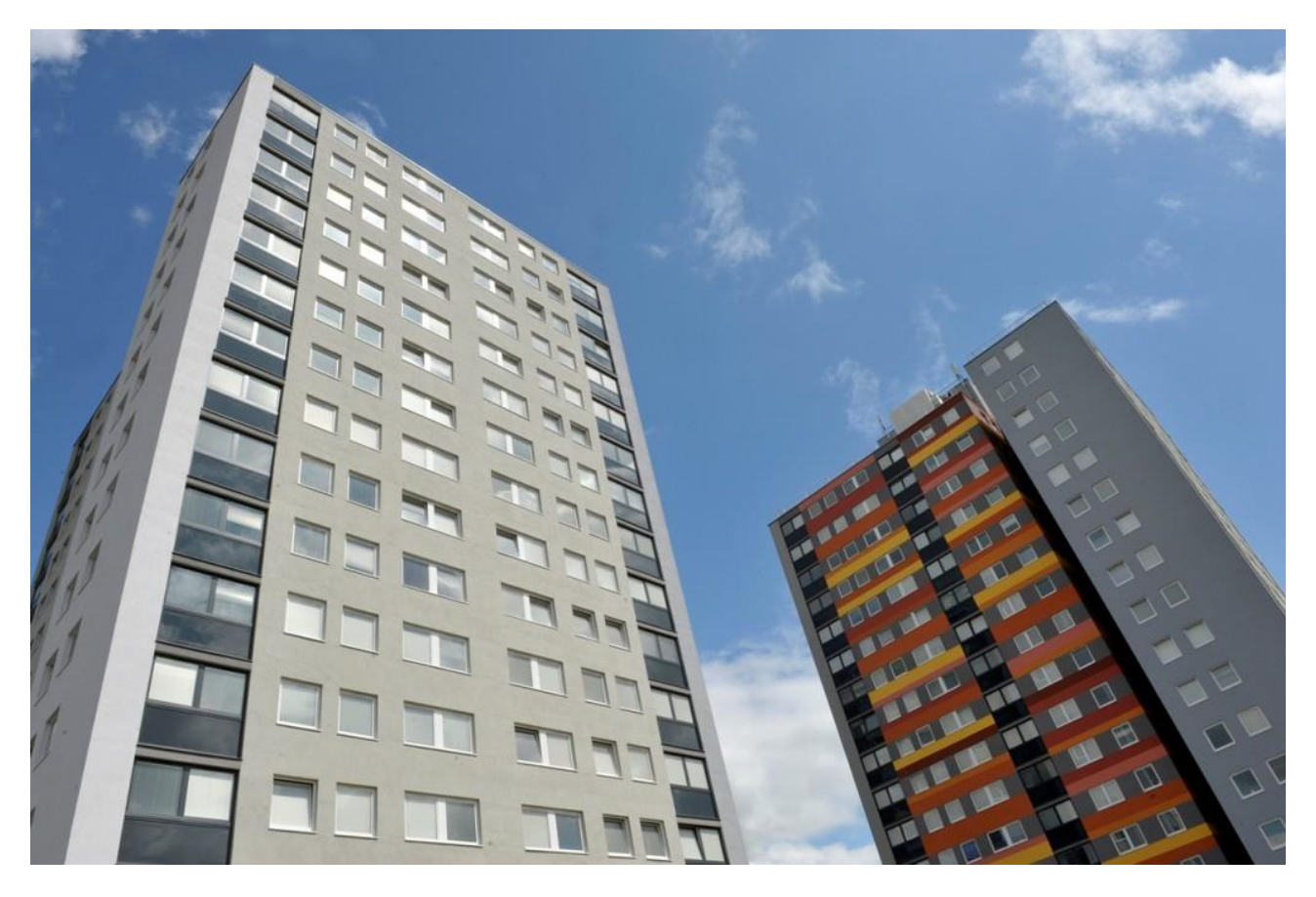
Colne and Mersea tower blocks after retrofitting in 2012

in the London Borough of Barking and Dagenham