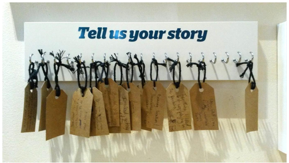
Inside Bristol Youth Hostel where a workshop was held with voluntary and community organisations on climate change